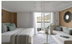
Deluxe Suite Deck 6