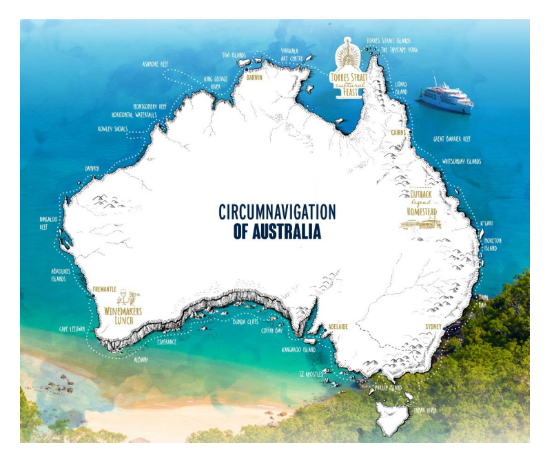
ITINERARY ACROSS THE TOP OF NORTHERN AUSTRALIA

Join us on a unique and pioneering expedition to discover the legend of Terra Australis Incognita, our great island continent, on a rare circumnavigation voyage around the remote shorelines of Australia. Be one of only 112 guests to undertake this epic adventure of a lifetime as we connect with remote natural places, significant historical sites, amazing natural encounters, and small cultural communities of Australia. Our all-Australian crew and special guest experts will provide local knowledge and insights as they proudly showcase the people, places and tastes that are Australian legend. Following on from the success of our sold-out inaugural Australian Circumnavigation in 2022, this voyage will feature 48 excursion days, visit 4 major coastal ports and include 3 significant events including a cultural feast in the Torres Strait, a Winemaker's Lunch in Margaret River and a charter flight to enjoy a day in the Outback at Longreach.