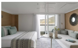
Deluxe Suite Deck 4