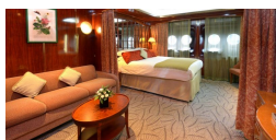
Magellan Deck Standard Suite