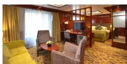
Explorer Deck Owner's Balcony Suite