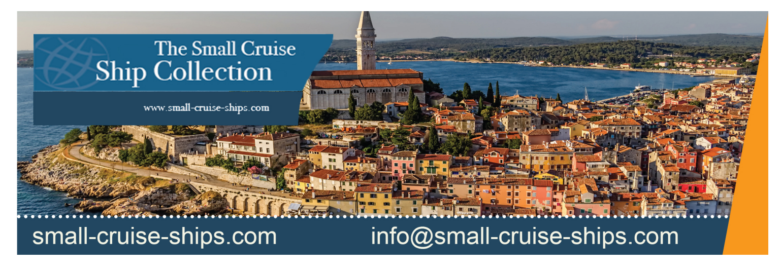
Day 5 / Wednesday: Hvar - Kor ula

We'll start our day with morning departure towards the Island of Kor ula. Before lunch on board, we shall stop for a swim in one of pristine bays en route. Our arrival to the Island of Kor ula is scheduled for the afternoon. Town of Kor ula is the island's main settlement and is known as the birthplace of Marco Polo, one of the world's most famous explorers of all times. Our English-speaking guide will take you for a tour of Kor ula Town, through its narrow and cobbled streets and its rich history. You'll have rest of the evening free to enjoy dining at one of the local restaurants of your choice. Overnight in Kor ula Historical Town, (B, L)