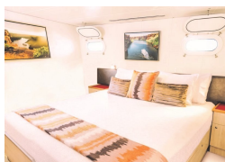
River Class - Double